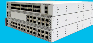
Cisco Catalyst 9500 Series

Cisco Catalyst 9500 Series switches are our leading fixed core/aggregation enterprise switching platform.